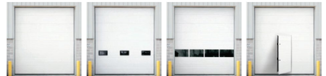
MODEL U100 closed door